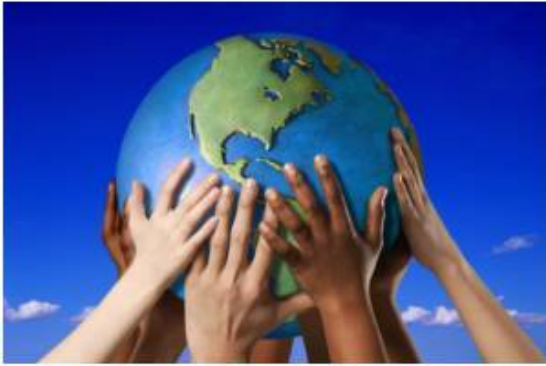
Diversity, Inclusion, & Life Sciences Symposium Research Report

Click to download or visit chisite.org/research